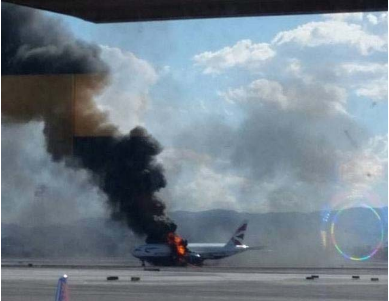
A passenger plane on fire... on the runway at McCarran International Airport in Las Vegas.