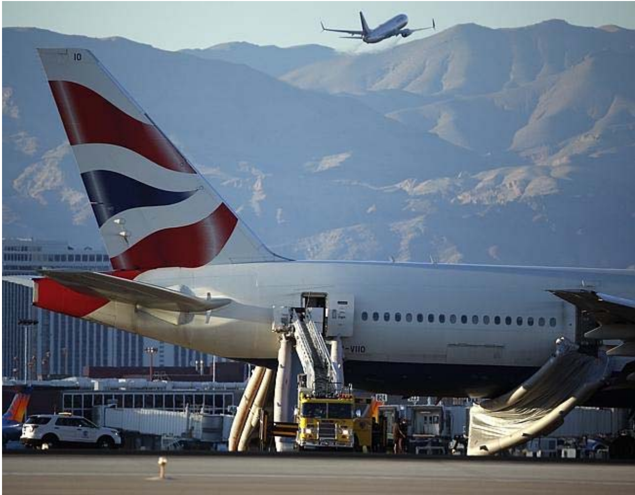
Dramatic incident ... the plane that caught fire, where passengers had to exit via the emergency slide.

Some of the passengers posted videos and pictures that showed plumes of smoke and flames engulfing the aircraft.