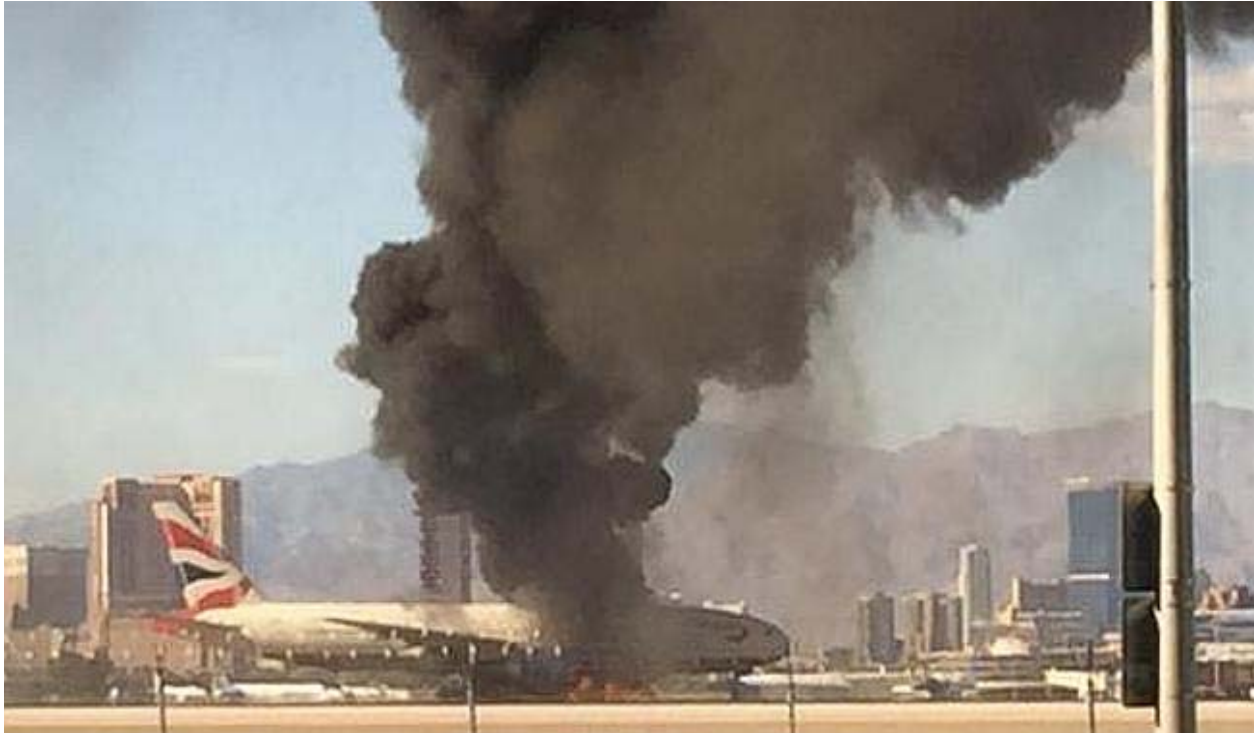
Burning ... Flight 2276 on the runway.

AN engine on a British Airways jet caught fire while the plane was preparing to take off from Las Vegas, forcing passengers to escape on emergency slides.