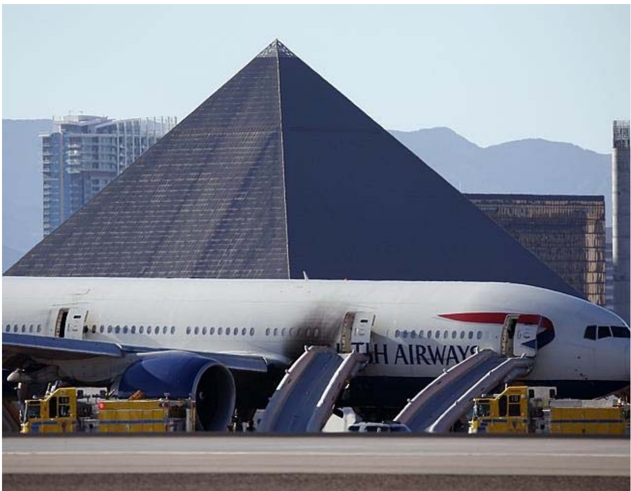
Crisis averted ... Casinos along the Las Vegas Strip can be seen behind the plane that caught fire.

McCarran Airport said air traffic had resumed normally apart from the runway where the British Airways plane was still parked by late afternoon.